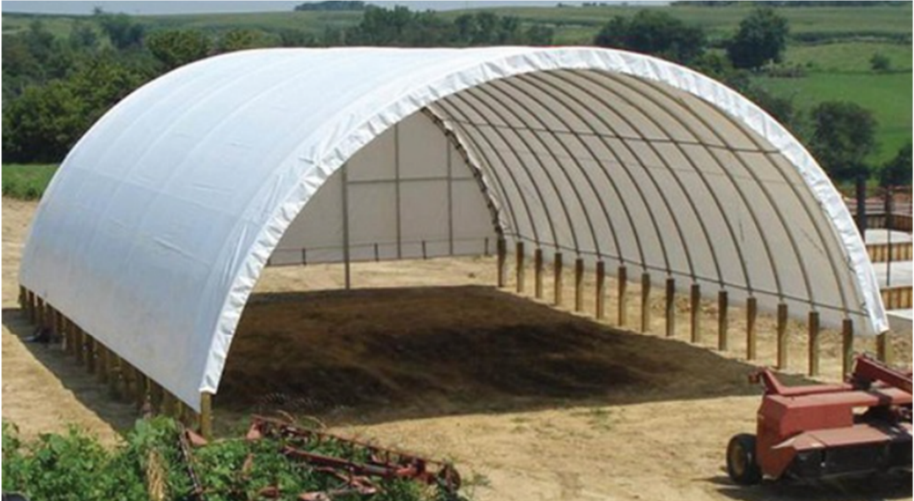
Actual image of a 38' x 40' arch building, wood post foundation shown

NOTE: Proposed building will be 38' x 32'. Proposed building will have a 4' concrete block foundation (similar to the two salt buildings that ACME currently has behind the store)